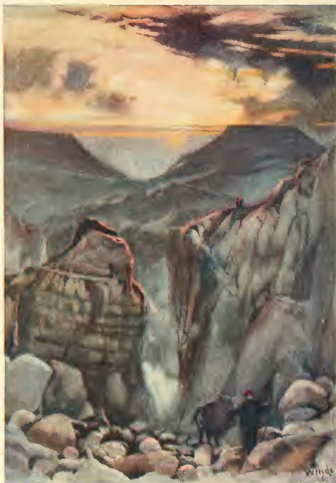
CASTILIAN TABLE LANDS.